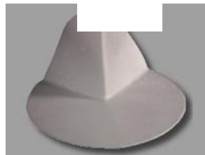
Example of Pre-molded Membrane Corner