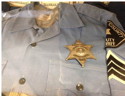
Late 1960s Summer Uniform