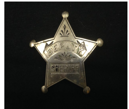
1880s-1890s ACSO Badge

We now have more display cases around the ACSO headquarters and we display many items from the 1880s through the 1990s. We are always looking for more unique items ( 1975-1979 maroon neck tie anyone??? ). If your item or photo is displayed, your connection will be noted on the accompanying placard. Thanks for your help!