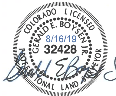
EXHIBIT ATTACHED AND MADE A PART HEREOF.